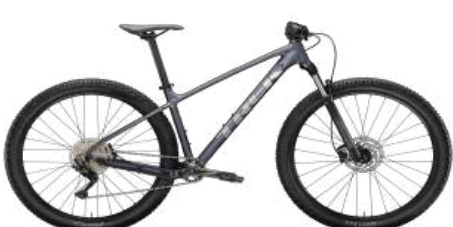
Trek Marlin 7