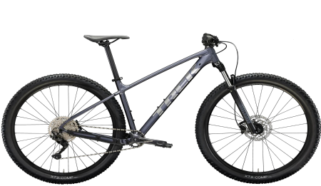
Trek Marlin 7