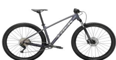
Trek Marlin 7