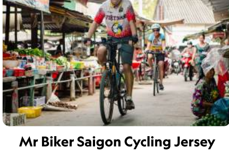
Mr Biker Saigon Cycling Jersey