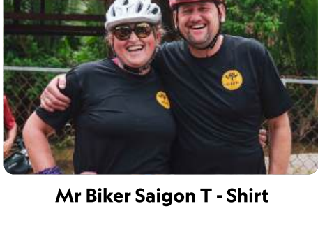
Mr Biker Saigon T - Shirt