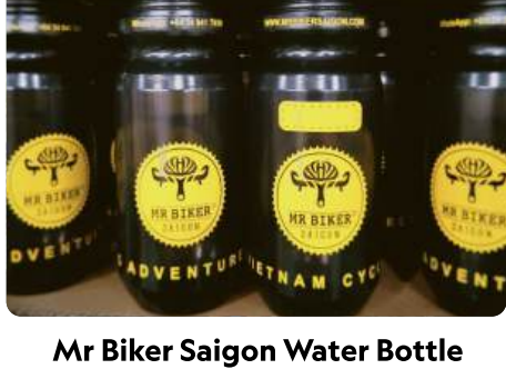
Mr Biker Saigon Water Bottle