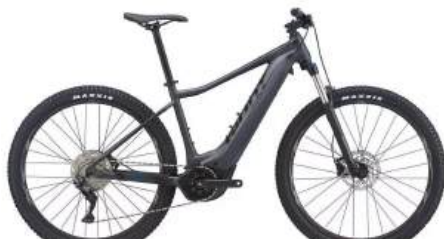
E-Bike Class 1 - Pedal Assist

Since our routes are mainly countryside roads, concrete or asphalt, with some dirt roads (3%) , we recommend using MTB or MTB hybrid bikes.