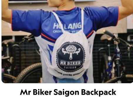
Mr Biker Saigon Backpack