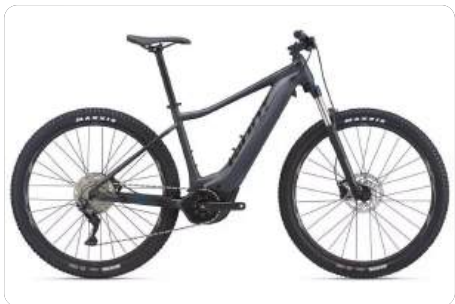
E-Bike Class 1 - Pedal Assist

Since our routes are mainly countryside roads, concrete or asphalt, with some dirt roads (3%) , we recommend using MTB or MTB hybrid bikes.