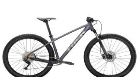
Trek Marlin 7