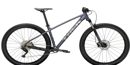
Trek Marlin 7